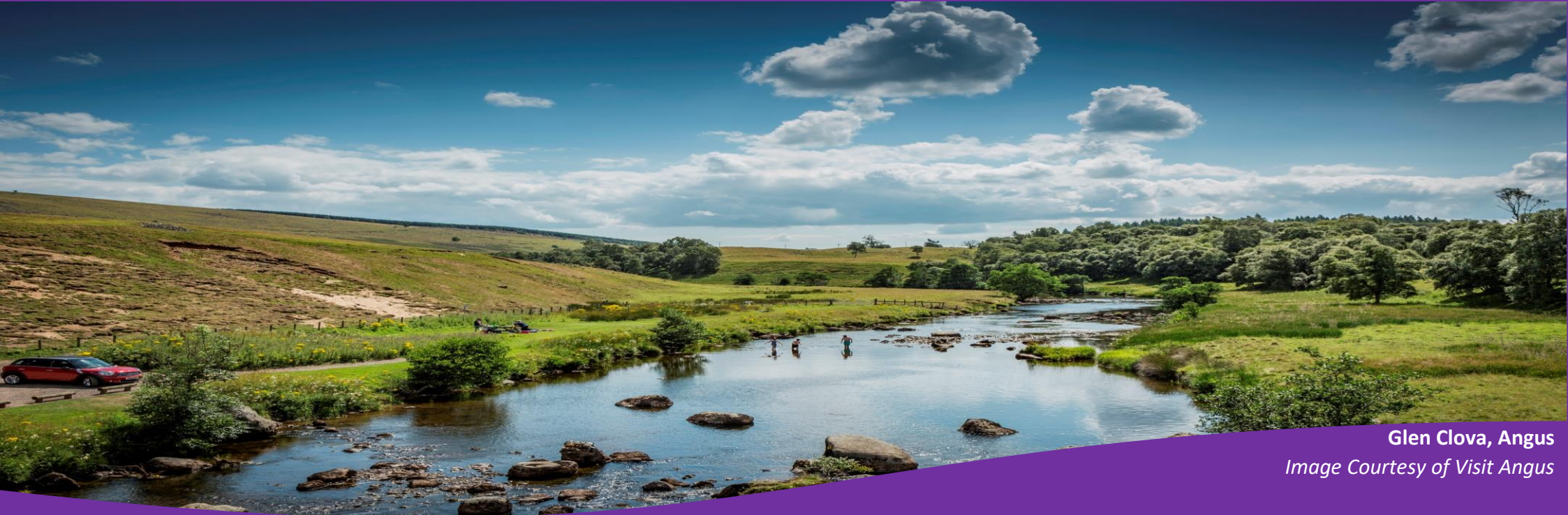
Glen Clova, Angus