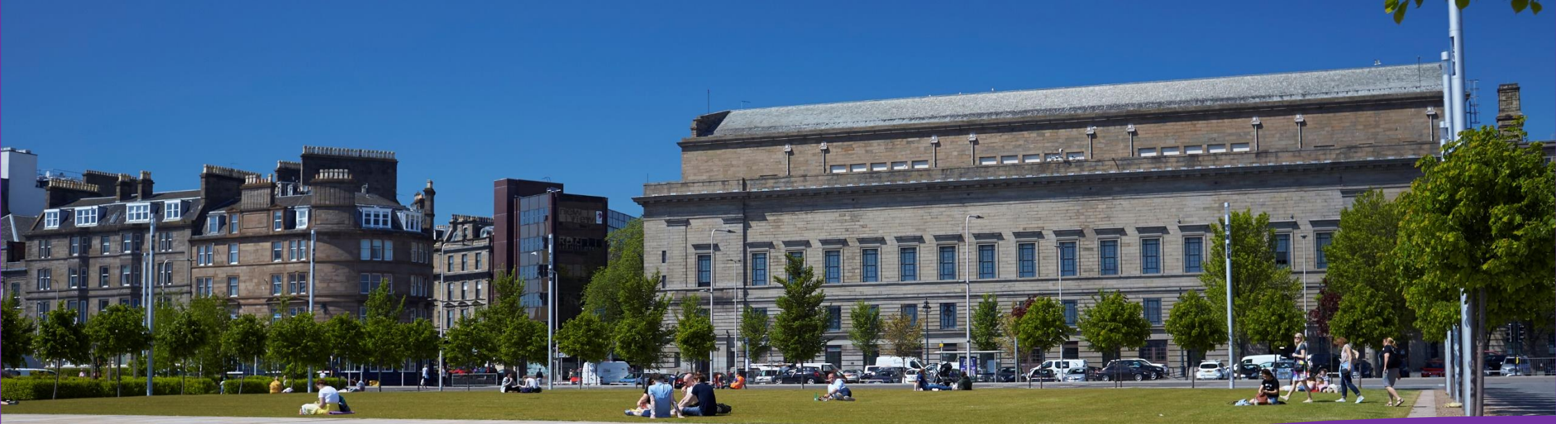
Slessor Gardens, Dundee