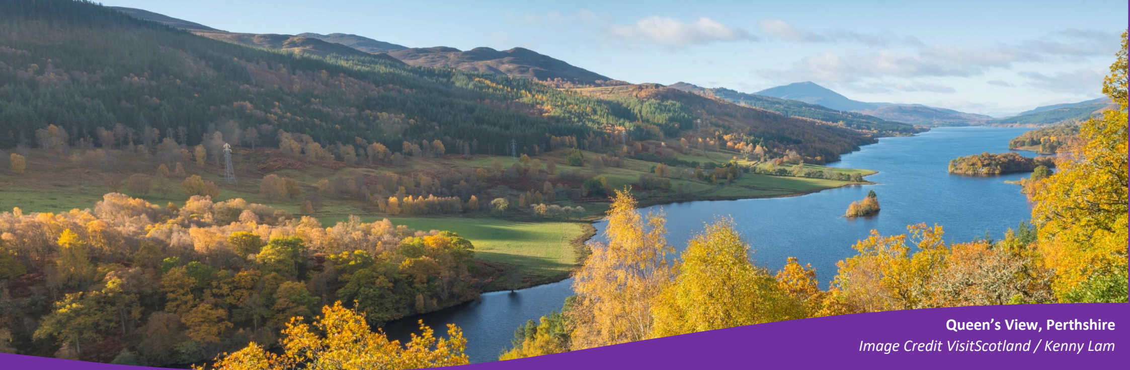
Queen's View, Perthshire