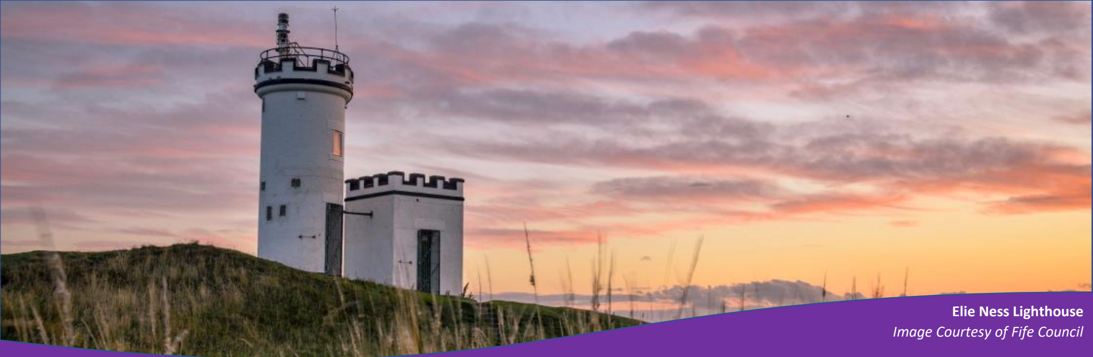
Elie Ness Lighthouse